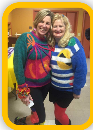
1st & 2nd Place Winners: